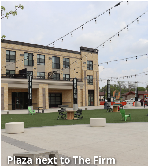
Plaza next to The Firm

344 Sheyenne Street, West Fargo, ND 58078