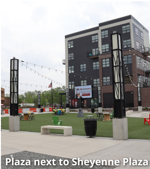
Plaza next to Sheyenne Plaza